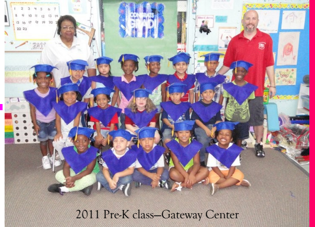
2011 Pre-K class—Gateway Center